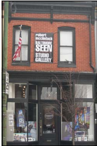
BALTIMORE SEEN @ 1005 S CHARLES ST