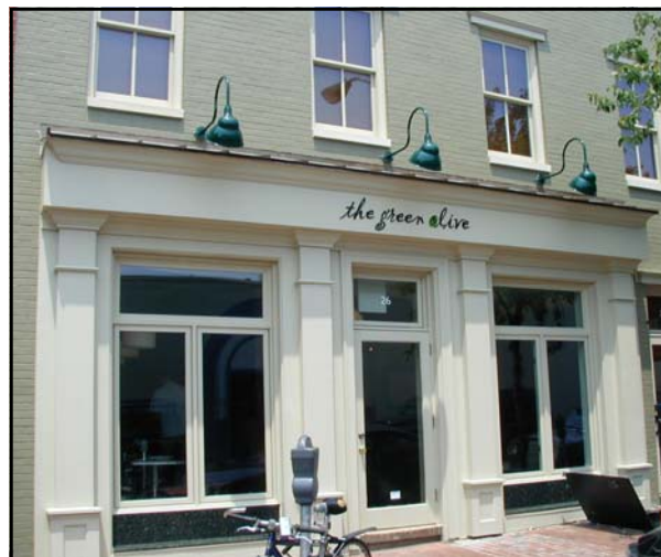
THE GREEN OLIVE @ 26-28 E CROSS STREET

Best Interior Restaurant/Bar Design: THE GREEN OLIVE