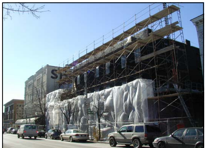
Shofer's construction site at 900 block of S. Charles Street

Contact Shofer's at 410-752-4212 or www.shofers.com