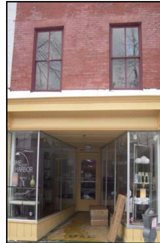
HOME ON THE HARBOR @ 1014 S CHARLES ST